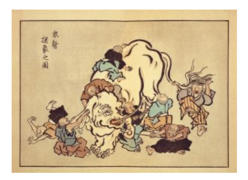
Figure 1: <u>The story of the blind men and the elephant</u> provides a metaphor for understanding the complexities of measuring organizational performance.

The number of performance measures and referents that are relevant for understanding an organization's performance can be overwhelming, however. For example, a study of what performance metrics were used within restaurant organizations' annual reports found that 788 different combinations of measures and referents were used within this one industry in a single year (Short & Palmer, 2003). Thus executives need to choose a rich yet limited set of performance measures and referents to focus on.